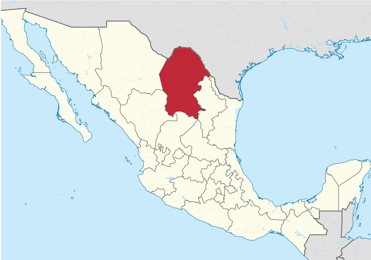
Map of Mexico showing the location of Coahuila state. IMAGE FROM WIKIMEDIA COMMONS