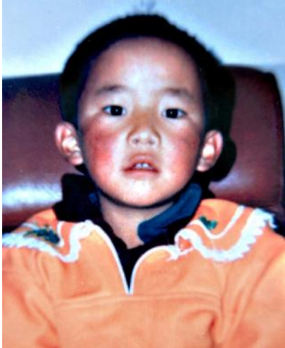
Gedhun Choekyi Nyima, the 11th Panchen Lama, who was kidnapped by the Chinese government as a six-year old child, and who has been missing in Chinese custody since 1995.