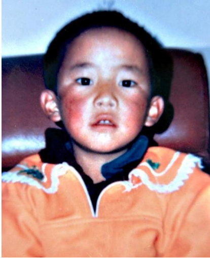
Gedhun Choekyi Nyima, the 11th Panchen Lama, who was kidnapped by the Chinese government as a six-year-old child, and who has been missing in Chinese custody since 1995.