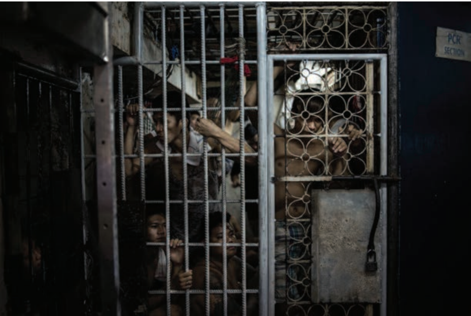
Detainees in Police Station 6 in Santa Ana, Manila, July 27, 2016.