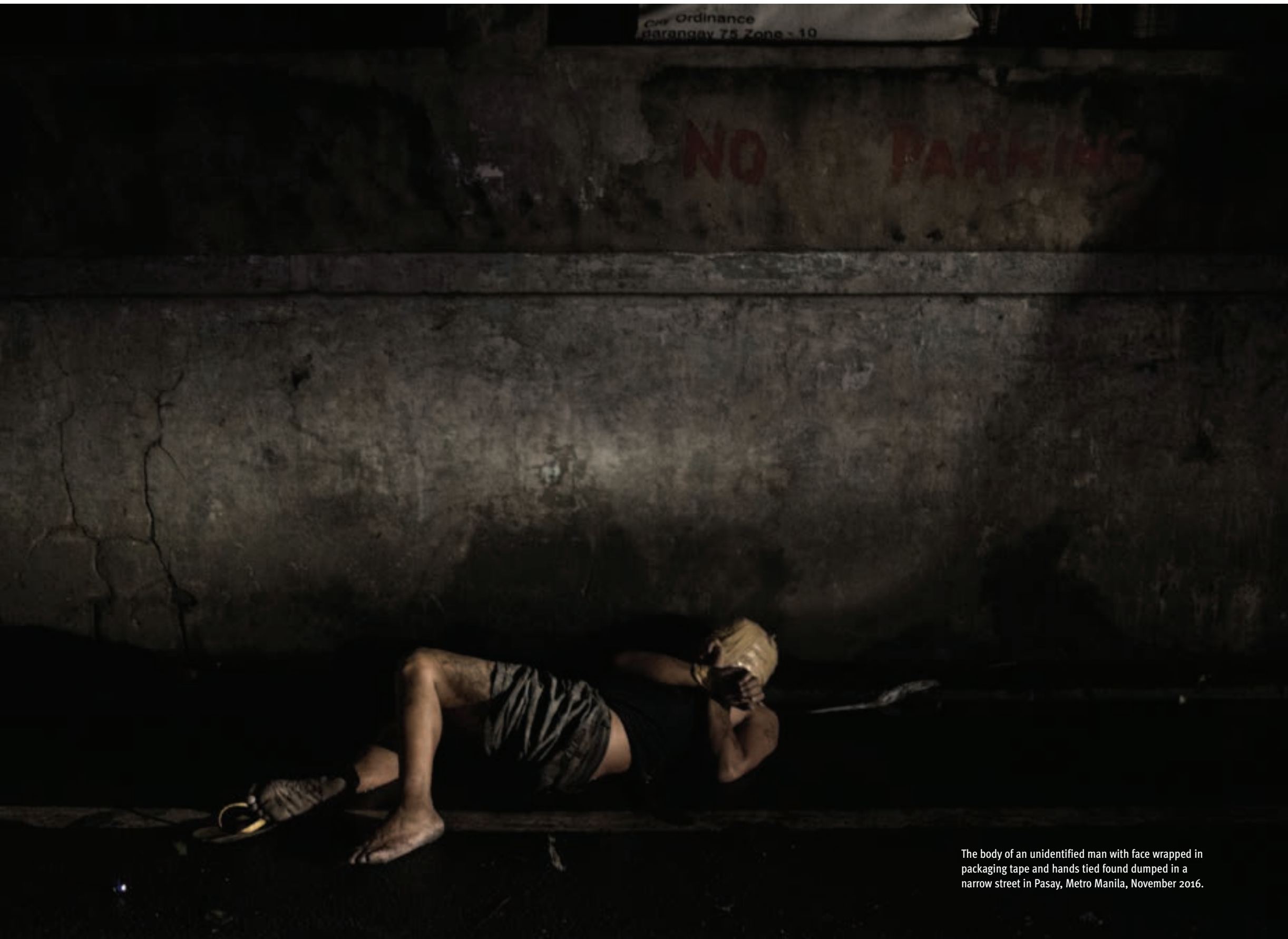
The body of an unidentified man with face wrapped in packaging tape and hands tied found dumped in a narrow street in Pasay, Metro Manila, November 2016.