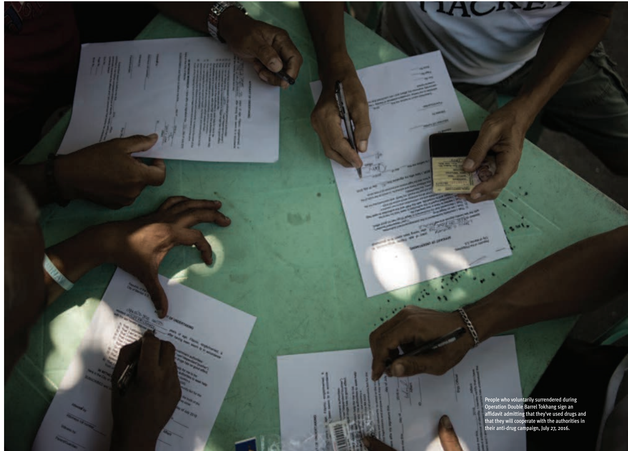
People who voluntarily surrendered during Operation Double Barrel Tokhang sign an affidavit admitting that they've used drugs and that they will cooperate with the authorities in their anti-drug campaign, July 27, 2016.

Even prior to announcing his candidacy for the May 2016 presidential election, Duterte was already very clear about his intention to eliminate crime by eliminating criminals: “If by chance that God will place me there, watch out because the 1,000 [people allegedly executed while Duterte was mayor of Davao City] will become 100,000. You will see the fish in Manila Bay getting fat. That is where I will dump you.”