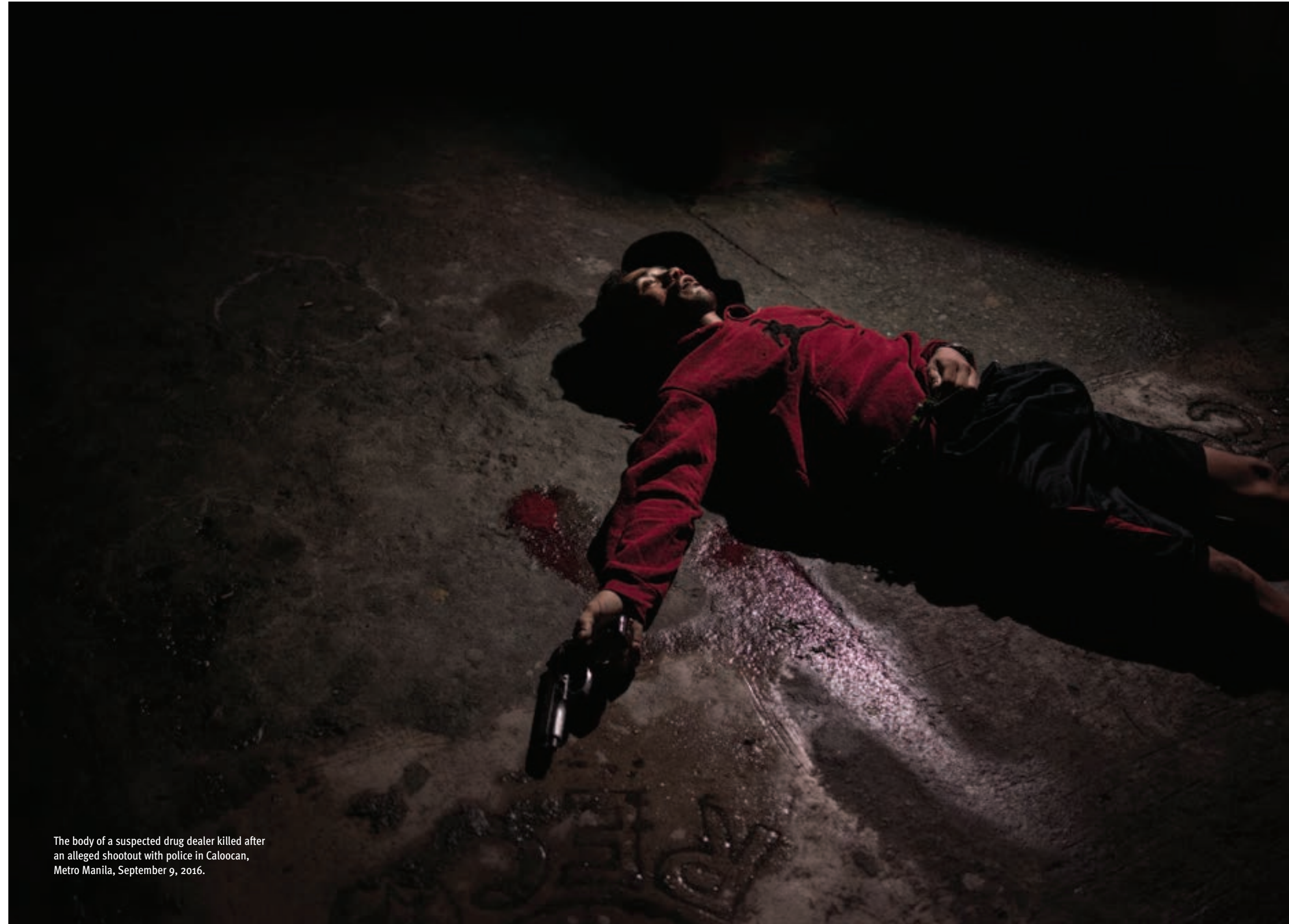
The body of a suspected drug dealer killed after an alleged shootout with police in Caloocan, Metro Manila, September 9, 2016.

Relatives, neighbors, and other witnesses told Human Rights Watch that armed assailants typically worked in groups of two, four, or a dozen. They would wear civilian clothes, often all black, and have their faces shielded by balaclava-style headgear or other masks, and baseball caps or helmets. They would bang on doors and barge into rooms, but the assailants would not identify themselves or provide warrants. Family members reported hearing beatings and their loved ones begging for their lives. The shooting could happen immediately—behind closed doors or on the street; or the gunmen might take the suspect away, where minutes later shots would ring out and local residents would find the body; or the body would be dumped elsewhere later, sometimes with hands tied or the head wrapped in plastic. Local residents often said they saw uniformed police on the outskirts of the incident, securing the perimeter—but even if not visible before a shooting, special crime scene investigators would arrive within minutes.