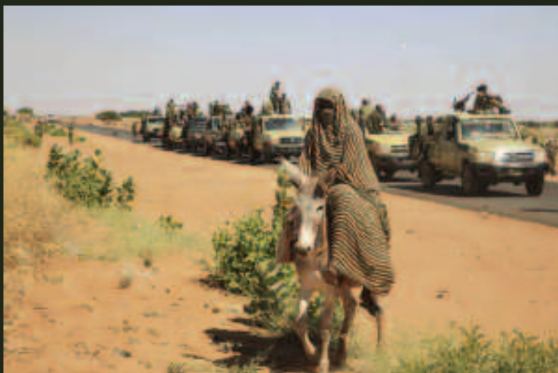
A government military convoy on its way to Tabit town in North Darfur, Sudan, November 20, 2014.

The United Nations and African Union should prioritize protection for the people of Tabit and press Sudan to immediately allow peacekeepers and investigators access, ensure a full, impartial investigation into the alleged crimes, and hold those responsible to account.