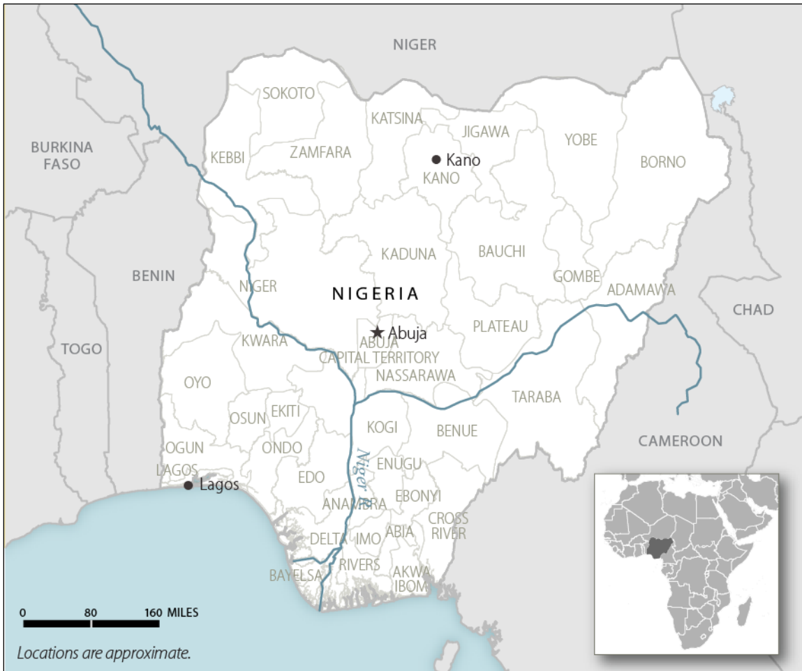
Figure I. Nigeria at a Glance

Recent protests in the Ibo-dominated Southeast have raised concerns about a resurgent separatist sentiment among some Ibo, who argue that they have also been marginalized by the government. From 1967 to 1970, the region suffered a deadly civil war as secessionists fought unsuccessfully to establish an independent Republic of Biafra. The recent protests, which began in October 2015, have led to clashes with security forces. Economic frustration is reportedly widespread in the region, but by many accounts the majority of Ibo would not support insurrection.